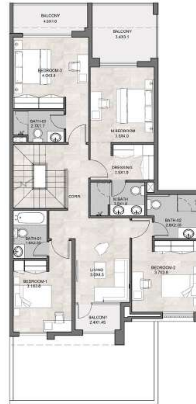
FIRST LEVEL PLAN