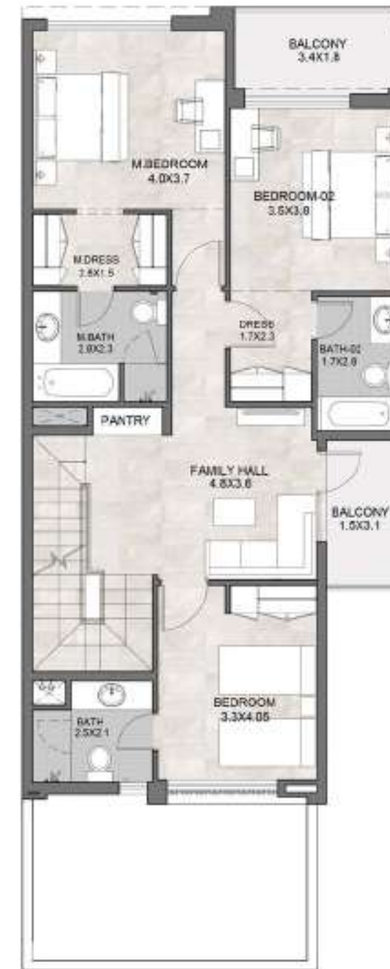
FIRST LEVEL PLAN