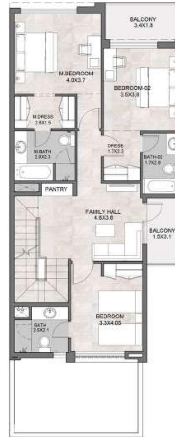
FIRST LEVEL PLAN